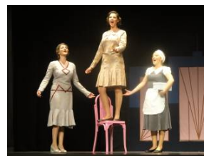
Scene from Los milagros del desprecio, Cambalache Teatro.

The Division on Sixteenth- and Seventeenth-Century Spanish Drama sponsored two sessions: "The Theme of War in Sixteenth and