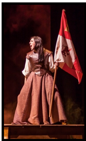
Scene from Grand Valley State's Antona García.

Cordial greetings from the President and Board of Directors of the Association for Hispanic Classical Theater. This issue of the newsletter includes, among other items, highlights of this year's Chamizal play festival and the Association's March Symposium, notes from the board meeting at the conference, news on upcoming conferences and performances and a call for papers for the 2013 Symposium of the AHCT in El Paso.