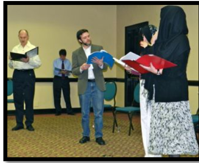
Members of AHCT perform a dramatic reading of Love the Doctor.