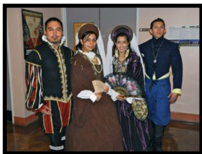
Chamizal personnel dress for the occasion at a reception to celebrate the opening of the 37 th annual Siglo de Oro Drama Festival.