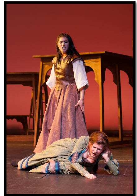
Scene from Grand Valley State's Antona García.