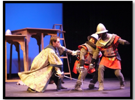
Scene from Antona García.