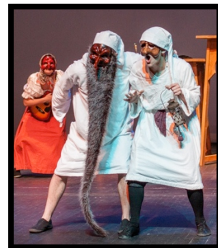
Scene from Grand Valley State's El Marión.