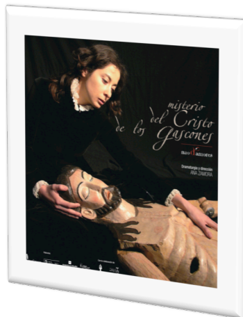
Poster of Nao d'amores' Misterio del Cristo de los Gascones.

Cordial greetings from the President and Board of Directors of the Association for Hispanic Classical Theater. This issue of the newsletter includes, among other items, highlights of this year's Chamizal play festival and the Association's March Symposium, notes from the board meeting at the conference, news on upcoming conferences and performances and a call for papers for the 2014 AHCT Symposium, which will celebrate the organization's 30 th year.