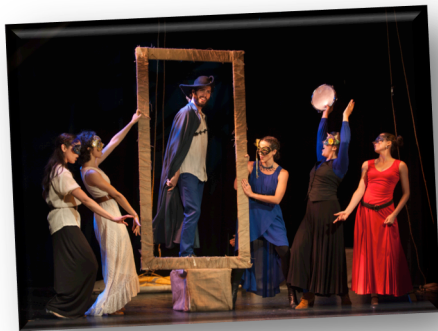
Scene from Repertorio's Reinar después de morir.

Once again, the Van Lier Fellowship productions at Repertorio Español, 138 East 27 th St., New York, NY, are all Golden Age plays. A number of AHCT members have attended the shows this