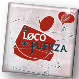
Poster, El loco por fuerza.

Call for Papers. The Association for Hispanic Classical Theater particularly encourages studies on all aspects of performance of Siglo de Oro dramatic texts, though proposals for papers or special sessions at the annual symposium on other topics related to Spanish Golden Age theater are welcome. Papers should be 20 minutes in length, and may be delivered in Spanish or English. To submit an abstract for the AHCT Symposium, fill out the AHCT Symposium Abstract Submission Form on the www.comedias.org website: http://www.comedias.org/AHCT/AHCT/2014_Conference_2.html . If you are a graduate student, after submitting your abstract through the website, please also send your completed ten-page paper in Word to